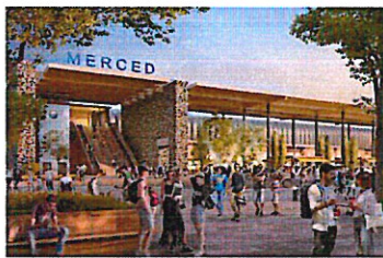
Rendering of the new HSR station in Merced

HSR will be the backbone of the integrated passenger rail and transit vision for the San Joaquin Valley. Early operations are expected to begin on the 171-mile Merced to Bakersfield segment between 2030 and 2033. Initial HSR service will substantially improve passenger rail travel times and frequency in the San Joaquin Valley.