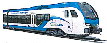
Valley Link will use zero-emission hydrogen trainsets.

Valley Link is a 42-mile passenger rail service over the Altamont Pass, providing a new, zero-emission transit alternative to congested Interstate 580. The 22-mile initial operating phase, which could break ground as early as 2025, will provide all-day, bi-directional service between the Dublin/Pleasanton BART Station in the San Francisco Bay Area and a new Valley Link station in Mountain House in San Joaquin County. Service will ultimately extend to the North Lathrop Transfer Station, where it will connect with ACE service.