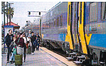
Service on the San Joaquins will expand as part of the Valley Rail program.

The Valley Rail program includes improvements and expansions of both the San Joaquins and Altamont Corridor Express (ACE), resulting in increased passenger rail service between the San Joaquin Valley, Sacramento, and the San Francisco Bay Area. Valley Rail will add daily roundtrips for both services between Sacramento and Merced, and they will link directly to HSR at the new Merced HSR Station.